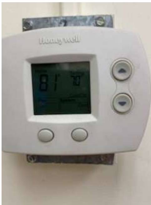
Figure 3 – Thermostat near Room 231, 81°F