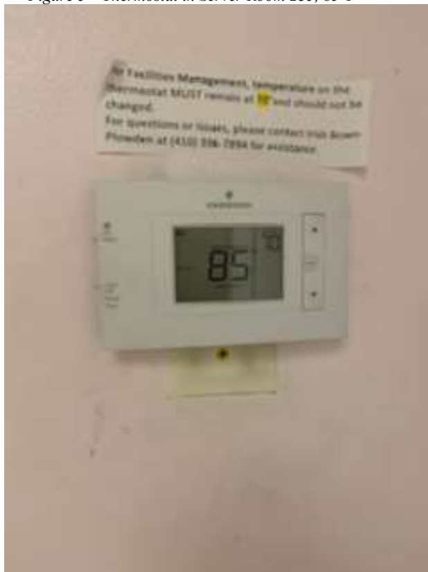
Figure 5 – Thermostat in Server Room 235, 85°F

Staff said there was a Department of General Services walk-through the previous week to evaluate the possibility of installing air conditioners. However, there were not enough windows for external AC units, and the electrical wiring in the building could not support freestanding AC units. Staff previously told the OIG that some of the clinic outlets are inoperable, and the router and electricity turn off if too many people use certain computers on one side of the building, which causes interruptions to everyone’s internet connections.