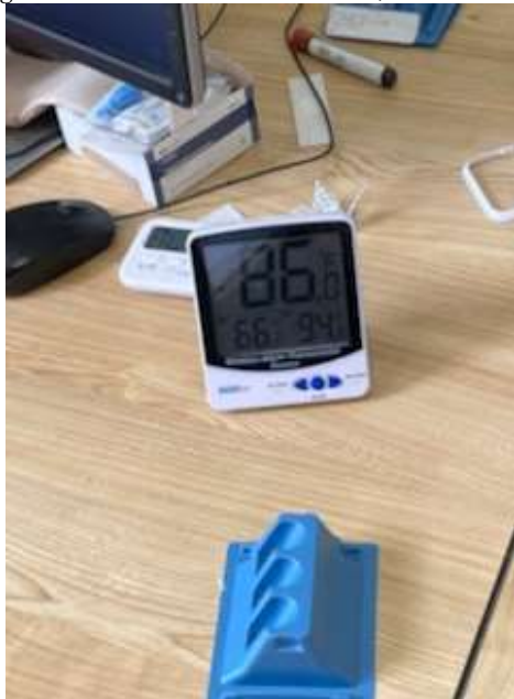
Figure 1 – Thermometer in Room 200, 86°F