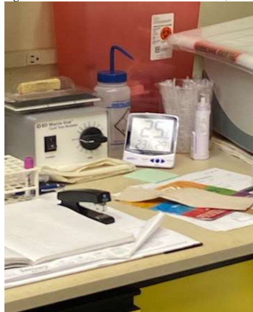
Figure 2 – Thermometer in Stat Lab Room 207, 25°C